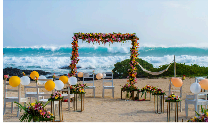
Secluded ocean shore beach view setting