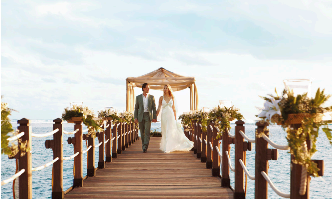
Resorts own private jetty and walkway overlooking the lagoon