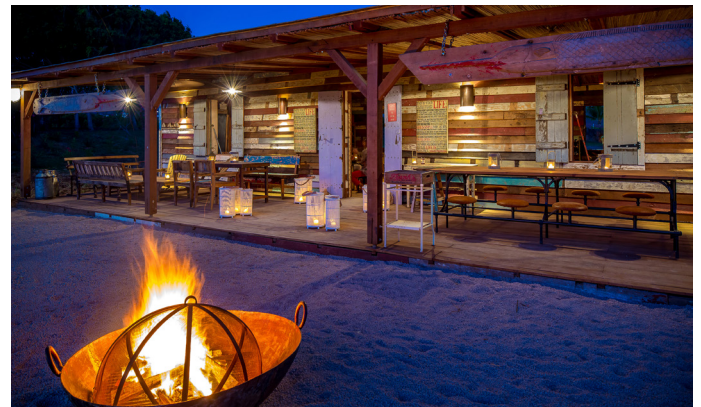
The "Rum Shed" unusual and quirky setting