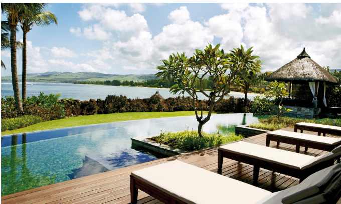
Privatized luxury "Shanti Villa" overlooking the pool and ocean