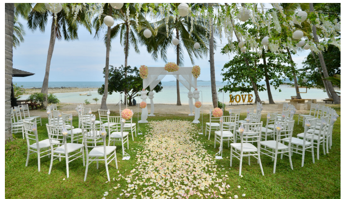
Lush mature tropical garden setting

NOTE – Dues possible adverse weather conditions a venue cannot be guaranteed. Your wedding planner will be able to provide a second option if needed. Alternate venues/area are available. Above images are illustrative only as set up can be amended to your liking.