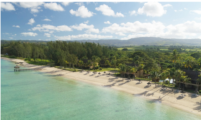
Shanti Maurice Resort & Spa dream lagoon beach